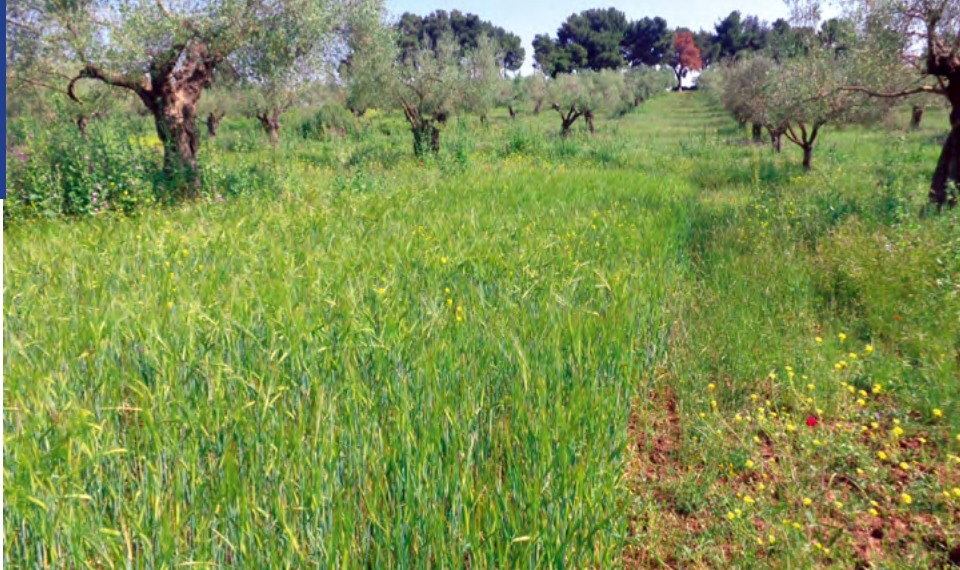
Olive trees intercropped with a mixture of barley and common vetch Ref : Mantzanas 2015