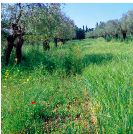
Olive trees intercropped with barley in spring Ref : Mantzanas 2016

Olive ( Olea europaea ) is the most widespread cultivated tree in Greece (Schultz et al. 1987). Olive trees alone, or in orchards, are found in all parts of the country that have a mild Mediterranean climate. The olive tree is considered to be one of the least demanding cultivated trees in terms of soil nutrients. For this reason, it is planted in poor, rocky areas with soils mostly derived from hard limestone. In traditional systems, practically all olive trees came from wild plants which were grafted. Edible olives and olive oil are the main products of olive trees, while secondary products include fodder for animals and firewood.