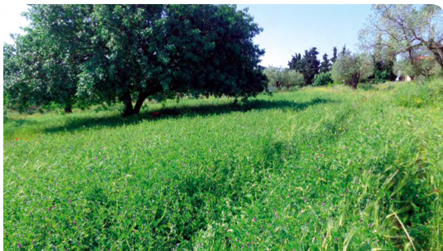
Impressive growth of the mixture (common vetch + barley) during the spring of second year Ref: Mantzanas 2016

The three year trial demonstrated an impressive growth of olive trees, and higher production of olives to that previously attained.